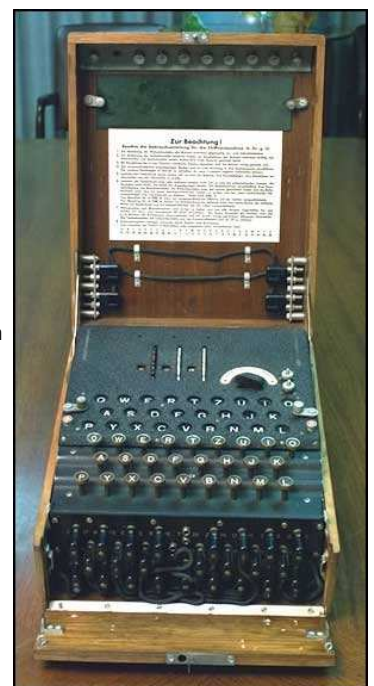
The Enigma Machine