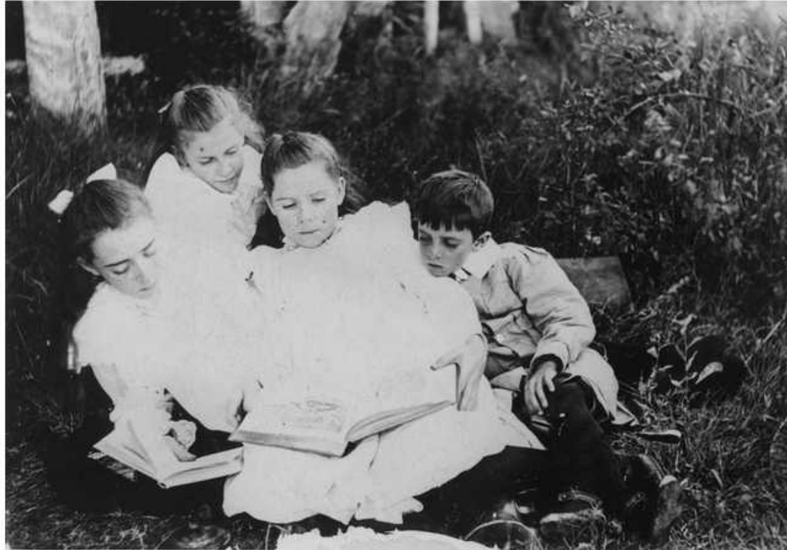
Group of children sitting on the grass reading books, 1900-1910