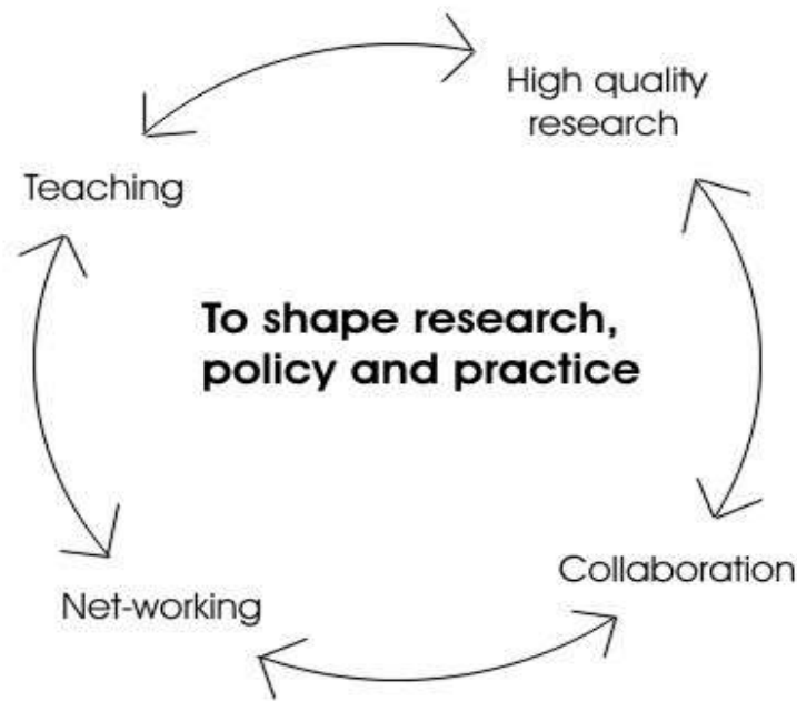
Figure 1. Interrelated activities of the Oxford Internet Institute